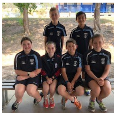
2019 House Captains